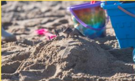
Dinosaur dig on Porth Beach